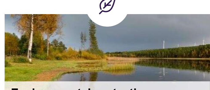
Environmental protection Provide systems minimizing risk of pollution and securing waste management